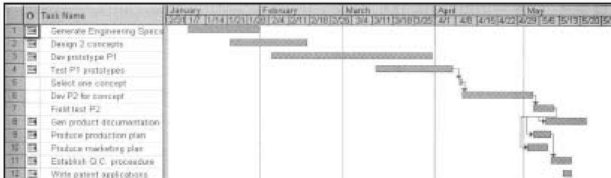
Figure 2. Example of a Gantt Chart.