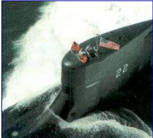
[Devenport et al., 1991]